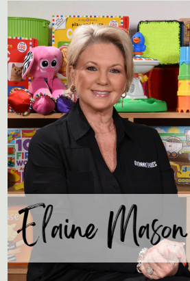
Board of Management & Administration