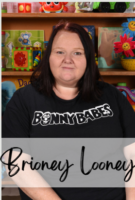
Centre Director & Nominated Supervisor