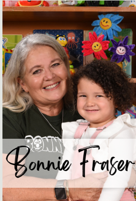
Managing Director, Board of Management & Licencee