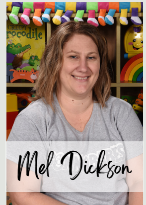
Centre Director & Nominated Supervisor