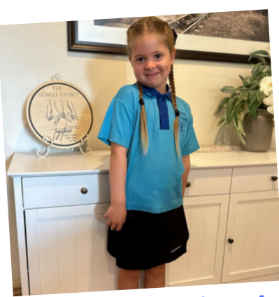
Our 'Schoolies' went off to big school