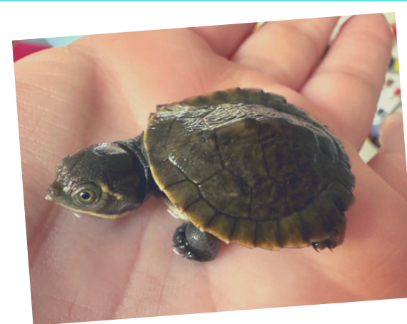
We had a little visitor in our Pre Prep One classroom