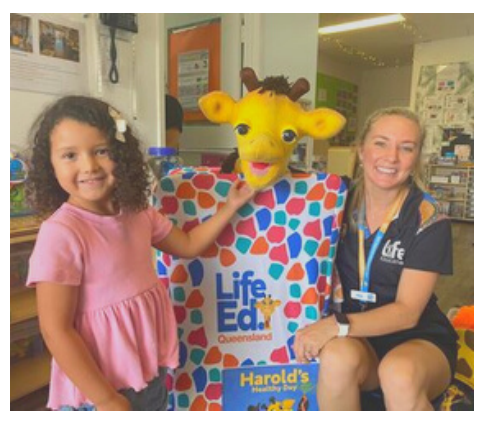
We Met Healthy Harold