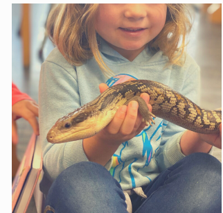
We spent time with our Pre Prep class pet lizard Haku