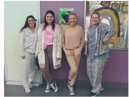
We all dressed up in our Pyjamas for PJ day