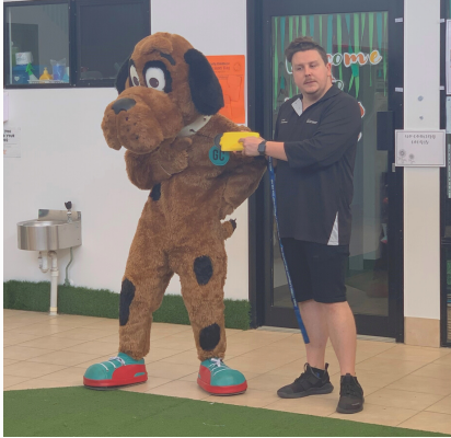
The GCCC pet safety show visited us