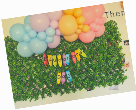
We celebrated Educators day!

We had kit kats and chit chats for R U OK day