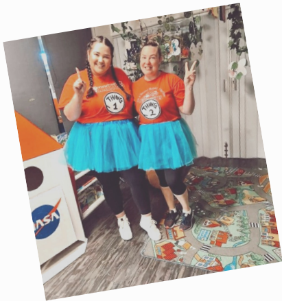
We celebrated Book Week with a special dress up day

We had fun learning about science during science week